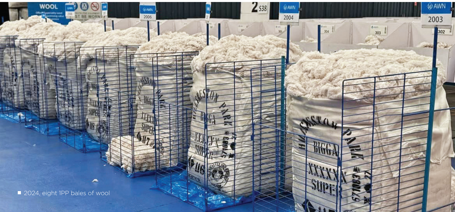
■ 2024, eight 1PP bales of wool